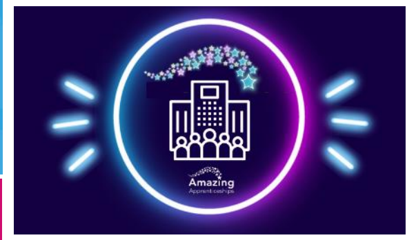
Apprenticeship Logo Game