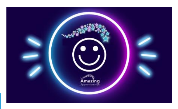
Apprenticeship Emoji Quiz

Did you know, providing your apprenticeship is in a different subject to your degree, you are able to access funding for further training!