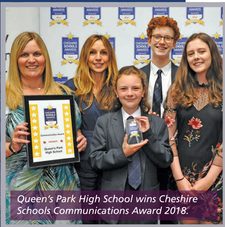
Queen's Park High School wins Cheshire Schools Communications Award 2018.