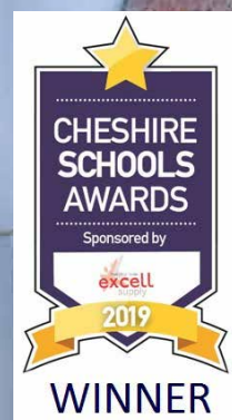
Queen's Park High School's Year 10 Stem Club win 'Team of the Year' at the Cheshire Schools Awards 2019