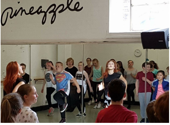
The trip has really inspired our students to engage further in the arts and a fantastic time was had by all.