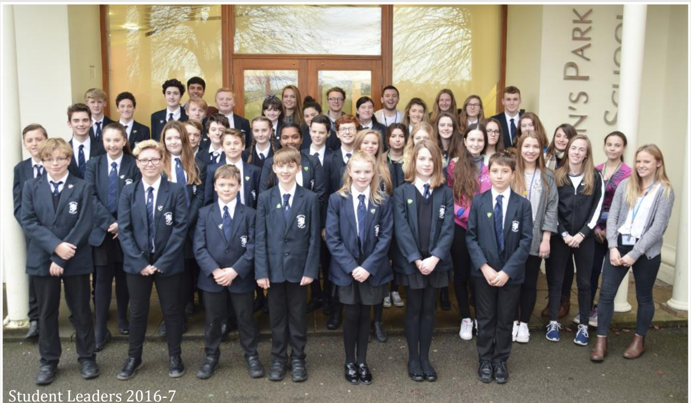
Student Leaders 2016-7